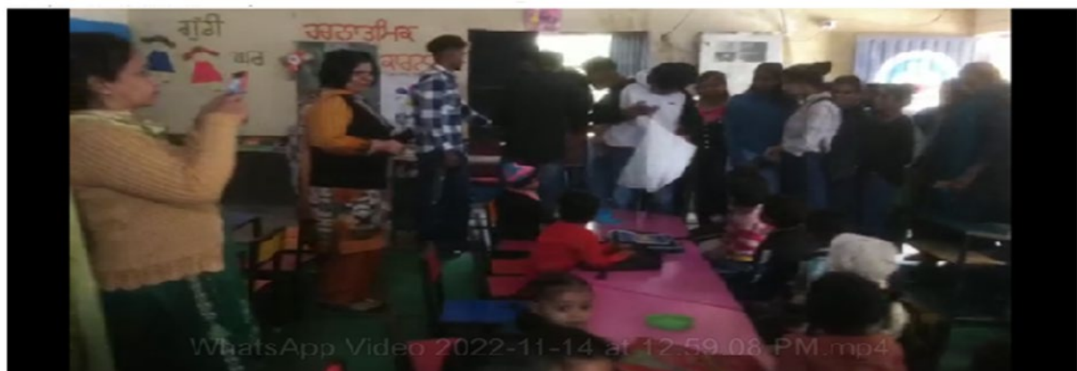
Glimpses of Children's Day celebrated at village Mukandpur on 14 November 2022