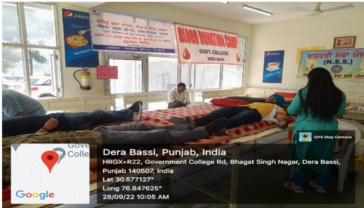
Students donating blood 28 th September 2023