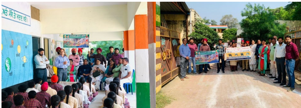
Media report of "Mega Awareness Camp" regarding non-burning of stubble at village Mukandpur