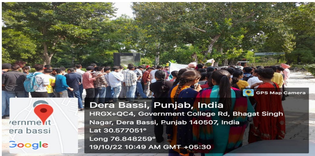
Start of ‘Mega awareness campaign’ regarding “straw burning” at government college

On 19-10-2022, the NSS students of the college conducted a “Mega Awareness Camp” against “ Stubble Burning” at the adopted village Mukandpur. This rally started from the college and reached the village of Mukandpur. There the students and staff interacted with the Principal of the senior secondary school, students and panchayat members and an interactive session was organized to present the ideas behind the rally. Awareness was created about the ill effects of stubble burning and its better use and responsiveness was intended through beneficial schemes of the government which can help people financially and technically to bring about change.